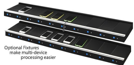
Optional Fixtures make multi-device processing easier